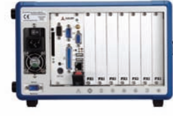
PXIS-2558T Back View