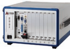
PXIS-2508 Front View

If the PXIS-2558T is used with a controller that does not match the rear transition module, the rear I/O functionality may not operate and may cause damage to the PXI controller or the rear transition module.