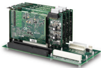
SSi bus cable for multiple cards synchronization